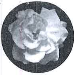
Village Flower "Gardenia"